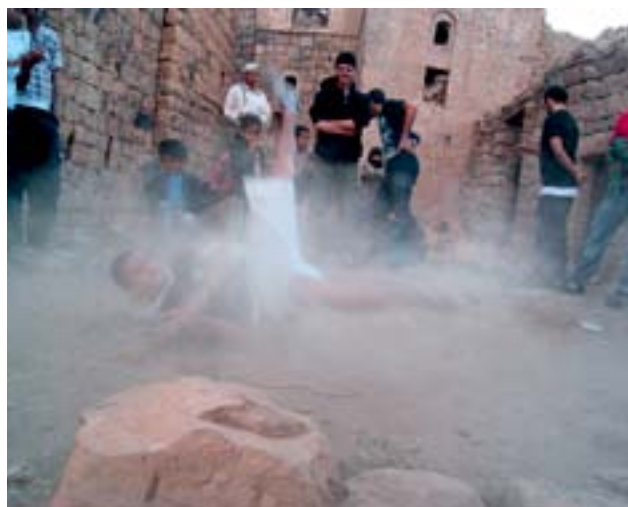
Boys from the hood: the Blastboyz in action

Hence the sport is a natural fit for kids anywhere who are bored or alienated by their surroundings. Breakdancing never went mainstream in the way that rap did. But this fact has allowed it to flourish internationally while staying under the radar. One of the most hardcore scenes, for example, can now be found in Korea.